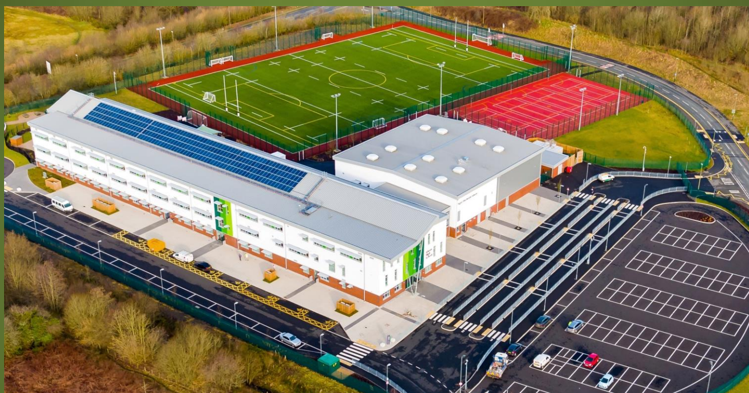
ISLWYN HIGH SCHOOL – OPENED JULY 2017